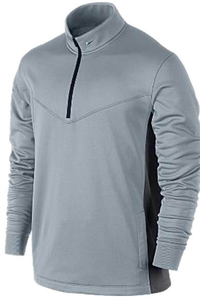
Nike Therma-Fit 1/4 zip pullover, $75

Available in Black, White, Light Grey (pictured), Navy, Royal, Carolina Blue, Orange, Purple, Green, and Crimson.