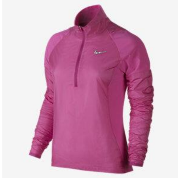
Thermal 1/2 zip pullover, $72

Available in White, Black, Navy, Green, Light Blue, Royal Blue, Purple, Pink, Red, Orange